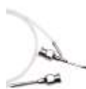
Irrigation / aspiration cannula Simcoe style port 0.4 mm 9985D