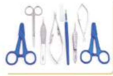
Oculoplastic procedure pack 9809D