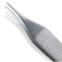
Adson's toothed forceps E1002D