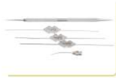
Syringing & probing procedure pack 9994D