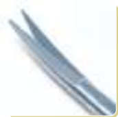
Conjunctival curved blunt scissors (bow) cut length 24mm 9928D