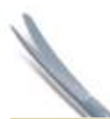
Dressing scissors cut length 40mm 9932D