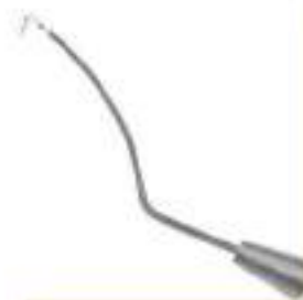
Chopper Green style left handed surgeon** tip length 2mm 9944D