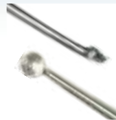
Double-ended curette (chalazion) spoon size 1.7mm & 2.6mm 9972D