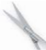
Williamson Noble scissors curved blunt blade length 18.2mm 9925D