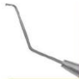
Chopper Nagahara style tip length 1.25mm 9942D