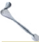
Desmarres retractor 12mm E4010D