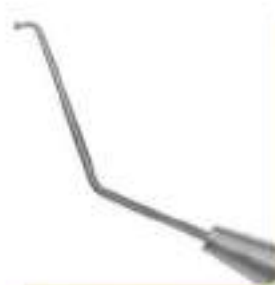
Mushroom Barret style tip thickness 0.65mm 9948D