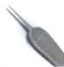
St. Martins forceps large 9909D