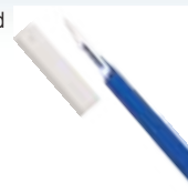
Scalpel handle no.3 with no.11 blade 9973-PD