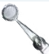
Lid clamp (chalazion) ring diameter 10.5mm 9970D