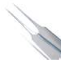
Corneal toothed forceps with platform tooth height 0.12mm 9906D