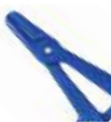
Swab holder forceps 9989-PD