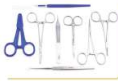
Dermafine procedure pack 9807D