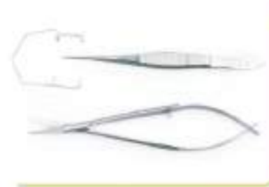
Sub-Tenons LA Lite procedure pack 9999D