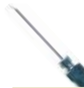
Hydro- dissection cannula Bolger style* 26G 9982D