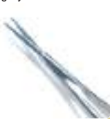
Vannas straight scissors blade length 8mm 9921D