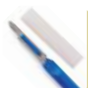
Barron's scalpel handle with no.15 blade E5000-PD