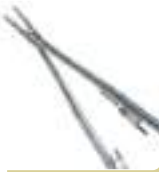
Needle holder (Castroviejo with lock) 9936D