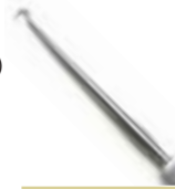
Skin hook (Gilles) E4000D