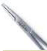
Halsey Webster needle holder E3000D