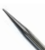
Punctum dilator (Nettleships) 9974D