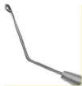
Micro paddle (Drysdale) 9939D

We understand the critical importance of 'second instruments' in phaco surgery. Acrofine® dispaz® micro manipulators are again hand finished. A wide range of tips are available to cater for the preferences of different surgeons.