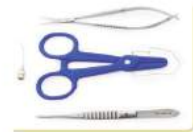
Sub-Tenons LA admin. procedure pack 9991D