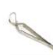
Towel clip 9988D