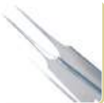
Corneal notched forceps with platform notch diameter 0.20mm 9905D