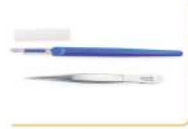
Lid lesion biopsy pack 9803D