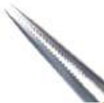
Moorfields forceps serrated tip 9919D