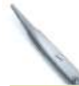
Stevens scissors (supercut blades) E2000D