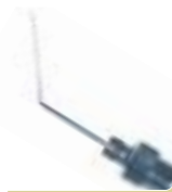
Hydro- dissection cannula angled* 25G 9980D