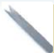
Braunstein calliper 3.5/4.00mm 9965D