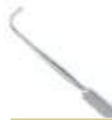
Squint hook (adult-Graefe) E4030D