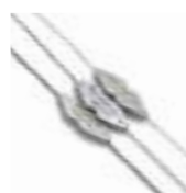
Lacrimal probes (set of 3) diameters 0.5, 0.7 & 1.0mm 9975D