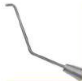
Lens dialler Sinskey style tip length 0.9mm 9945D