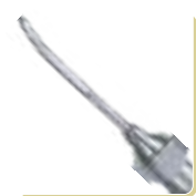
Sub- Tenons cannula* 9979D