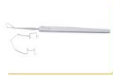
Neonatal examination pack 9998D