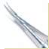
Needle holder (Bates) jaw length 10mm 9935D