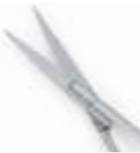
Williamson Noble scissors cured pointed blade length 18.2mm 9924D