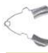
Lid speculum - Acrofine guarded 9964D