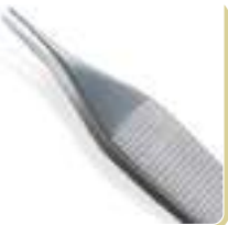
Adson's plain forceps E1000D