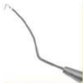
Chopper Green style right handed surgeon tip length 2mm 9943D