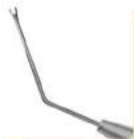
Y-dialler Bechert style tip length 0.5mm 9947D