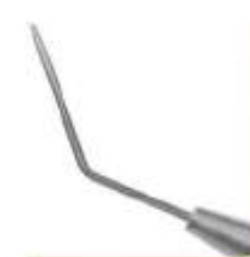
Iris repositor round blade 9959D