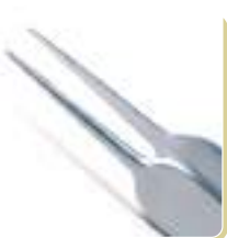
St. Martins forceps tooth length 0.27mm 9917D