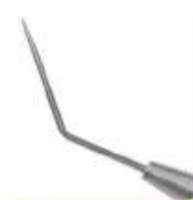
Iris repositor flat blade 9949D