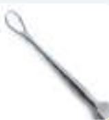
Vectis / scleral indenter 9966D