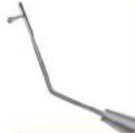
T-dialler Lester style tip length 1.4mm 9946D