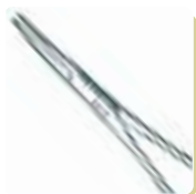
Artery forceps curved 9986D