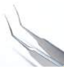
Ultracurved forceps angle to tip 13mm 9910D