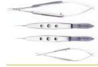
Micro suturing procedure pack 9996D