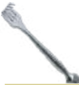
Cats paw retractor (Blair-Rollet) 8mm E4020D