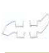
Lid speculum (adult)* standard 9960D & temporal access 9961D