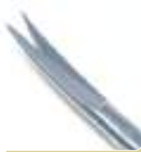
Conjunctival straight pointed scissors (bow) cut length 24mm 9929D