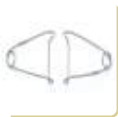
Wire lid retractor (Cox Jaffe) 9963D