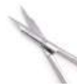
Westcott scissors blunt 9927D