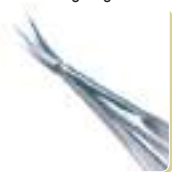
Vannas curved scissors blade length 8mm 9920D

Acrofine® dispøz® ophthalmic scissors have been carefully selected for a whole range of uses from cutting bandages to managing very fine intraocular tasks. Being single-use instruments they are always sharp. The Acrofine® dispøz® needle holder has been designed to combine the finesse of a micro needle holder and fine suture tier with the utility and feel of an instrument capable of handling larger needles used in lid surgery.