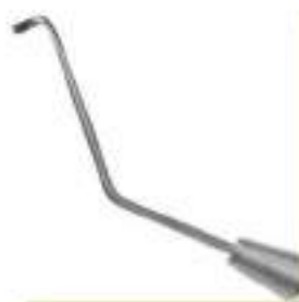
Micro spatula (Tayyib) tip length 1mm 9940D