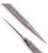
Punctum dilator / seeker (double- ended) 9976D