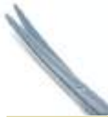
Enucleation scissors cut length 26mm 9931D