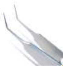
McPherson forceps angle to tip 8mm 9908D