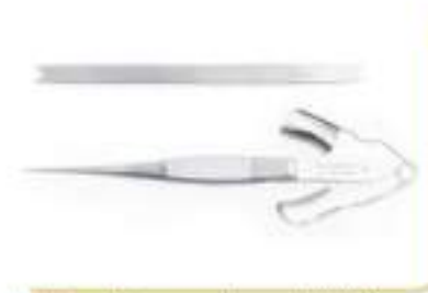
Intravitreal Lite procedure pack 9995D Variants: 9995-1D with lid speculum (phaco) instead of Acrofine guarded speculum

Just open one tray for one operation and it's all there. Acrofine® & Dermafine dispaz® instruments and procedure packs are the way forward both for the modern operating theatre and the community-based surgeon. Eyeline's procedure packs consist of: