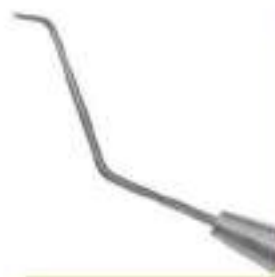
Micro finger tip length 2mm 9941D