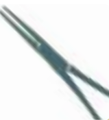
Artery forceps straight 9987D