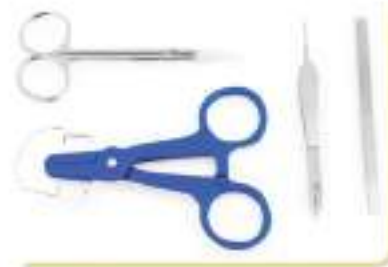
Intravitreal injection procedure pack 9993D