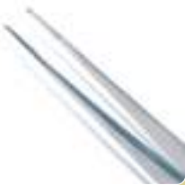
Jayles forceps tooth length 0.27mm 9918D