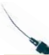
Hydro- dissection cannula Helsinki style* 26G 9981D