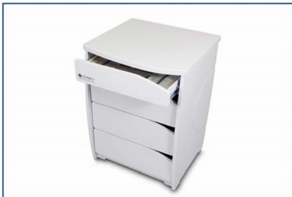
Trial lens cabinet TC-1000 (optional)