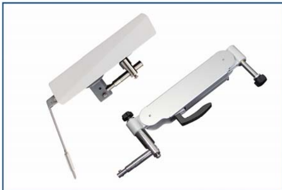
Phoropter arm PA-2000 and PA-1000 (optional)