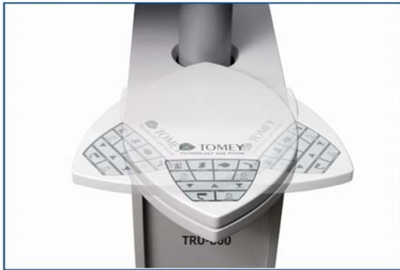
Rotatable control board panel

Perfect if you need a tiny and clever solution for your refraction environment. Much smaller than standard refraction units does it even fit to very small rooms. For a proper refraction just attach all essential instruments as manual/automatic phoropter and chart projector to the TRU-800. If you want space for hand-held units or trial lenses - the optional trial lens cabinet TC-1000 meets with the design.